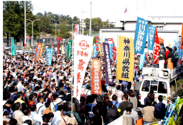
Protest against base reorganization plan outside Camp Zama in 2005

1) Zama, on Tokyo’s southern outskirts, was designated as the HQ of US forces in Japan and prospective site for relocation of the US 1st Army HQ from Fort Lewis in Washington State. At present Zama City is the sole local district penalized for non-cooperation under the under the 2007 law for facilitating the reorganization of US Forces in Japan. The mayor of Zama, who has sworn that he will stand firm even if the government (Japanese, US, or both) were to target him with a Cruise missile, faces election for a 7th term in August 2008.