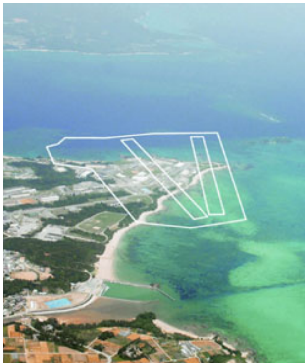
The Henoko base construction plan for twin runways

Prime Minister Koizumi recognized defeat, dropped the design to which Japan's government had been committed for a decade, and in the US-Japan Agreements on Reorganization of US Forces in Japan (2005-6) adopted a new plan. This time, instead of a construction offshore from Henoko, the base would be built on Cape Henoko itself and would be developed out of an existing US base, where he must have assumed that construction works could more easily be screened from public protest. But no change could conceal the fact that the heliport of 1996 had evolved into a monster comprehensive sea and air-base, with twin, V-shaped, 1,600 metre runways, to be constructed on the almost pristine marine environment, where a precious colony of blue coral was only discovered during 2007, where the protected dugong graze on sea-grasses, turtles come to rest, and multiple rare birds, insects and animals thrive.