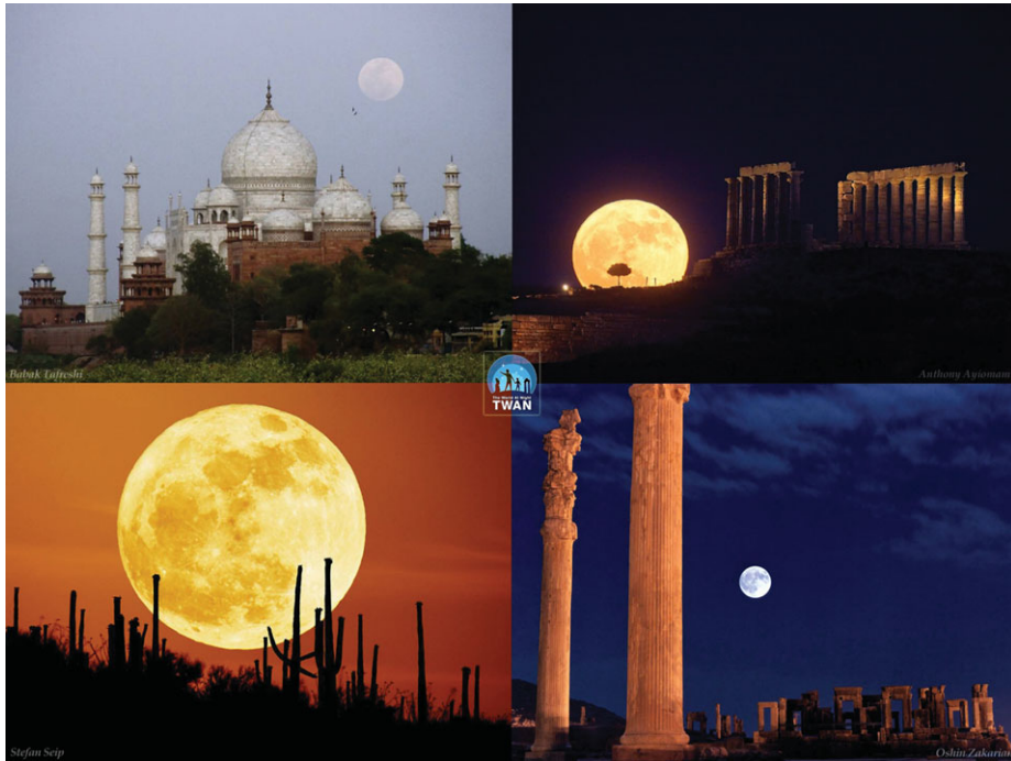
Figure 3. Moonrise in India, Greece, USA and Iran.