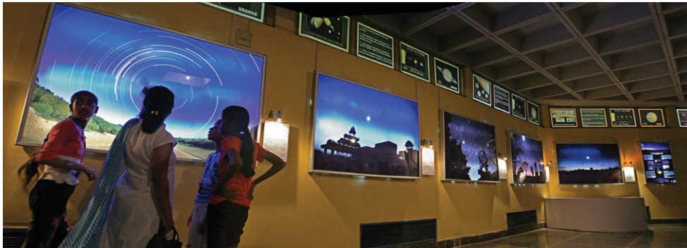
Figure 2. An exhibition by TWAN at the Dehli Planetarium, India.

(a) To better connect people with astronomy using beautiful and educative images with familiar landmarks of daylife. The “ Earth and sky ” photographs resonate with viewers on an instinctive level. And they spark the imagination. Familiar landmarks provide a context viewers relate to, even among city dwellers who have never gazed in wonder at the Milky Way. TWAN images also show that the night sky can be enjoyed with nothing more than the unaided eye. Meanwhile some important principles of astronomy and sky gazing are easily described through these images. The artistic images are aimed to be a public gateway to astronomy, and science in general.