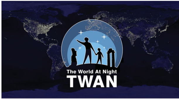
Figure 1. The logo of TWAN.