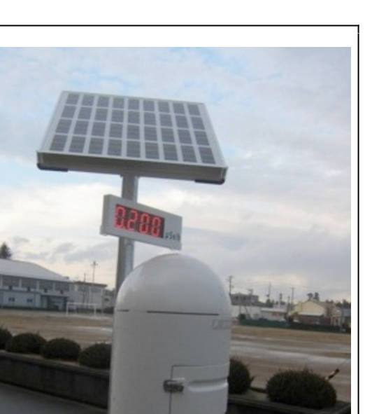
Outside IItate Village Office, Feb. 2012

Cleaning up the contamination and convincing people to return is a mammoth task. Across the region, workers in boiler suits and masks have descended on towns with power hoses, trying to scour the Daiichi plant's toxic payload from playgrounds, parks and other public areas. The workers have removed most of the most dangerous contaminant - cesium - from the grounds of Minamisoma Middle High School, says its principal Hamano Shinichi. Like other public buildings here, the school has planted a large dosimeter outside its front gates showing the current radiation in large digital letters in an attempt to reassure local parents - with limited success. Only half of its 360 students have returned since last year, Principal Hamano admits.