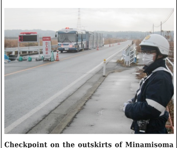
Checkpoint on the outskirts of Minamisoma into the 20km exclusion zone

Today, the power plant is officially "in a state of cold shutdown" according to Tepco. The 20km exclusion zone that surrounds it runs into the southern border of Minamisoma and swallows up Mayor Sakurai's small farm. Police officers with dosimeters pinned to their chests prevent locals from going through a roadblock, even the Mayor who runs the city. Reporters and citizens who venture inside through back roads can be arrested.