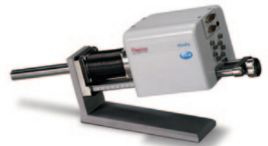
UltraDry EDS Detector Fastest Collection, Most Accuracy

• Discover more: thermoscientific.com/microanalysis