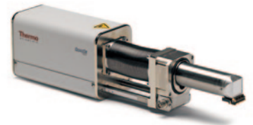
QuasOr EBSD Simultaneous EDS. Better data.