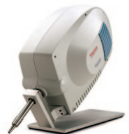
MagnaRay WDS Resolution with EDS Ease of Use