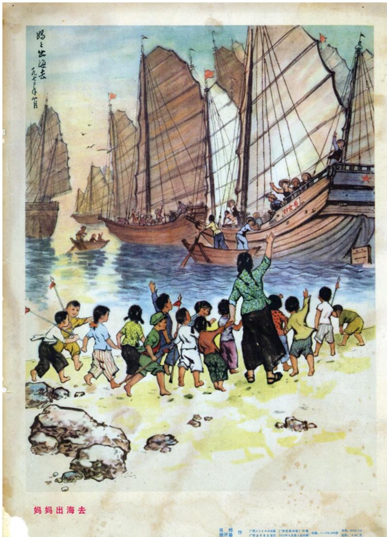
Figure 8. Mama is going to sea, 1973.

Many of these women had been local village activists in the 1950s: attending meetings, reading simple texts, speaking in public, and leading groups of women to labor in the collective fields. In these respects, they supported the national project of socialist construction. But then, these young women began to have children (see figure 8). They reared those children in the 1950s and 60s and 70s, working in the fields for work points most of the day and staying up at