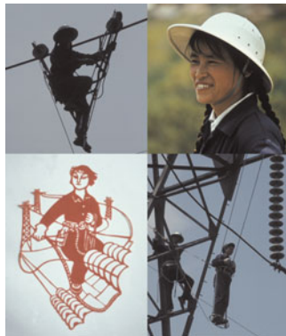
Figure 4. Women repair high-voltage wires. Photographs by Gail Hershatter, 1975.