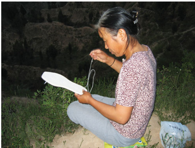
Figure 7. Woman sewing, Shaanxi Province.

How did this come about? Before collectivization, one or more married sons typically remained under the same roof as their parents, with all the able-bodied adults pooling labor and resources, and the daughters-in-law assuming increasing responsibility for household management as their in-laws aged. When a father died, land was divided among surviving sons. During the Mao years, collectivization eliminated private landownership, although families continued to pass their houses on to their sons. Meanwhile, families grew, as more children survived infancy because of the end of warfare, relative political stability, and improvements in public health. With both men and women working in the collective fields, grandparents, especially grandmothers, bore an increasing burden of domestic work (see figure 7), and whatever work points the elders earned went to feed expanding broods of grandchildren. In order to shield themselves from the consequences of growing families, stagnating household incomes, and unacknowledged, unremunerated labor, the senior generation often initiated a formal household division, creating a separate household for collective accounting purposes and the distribution of work points and grain. This did not mean that elders