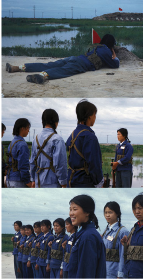
Figure 3. Women militia. Photographs by Gail Hershatter, 1975.