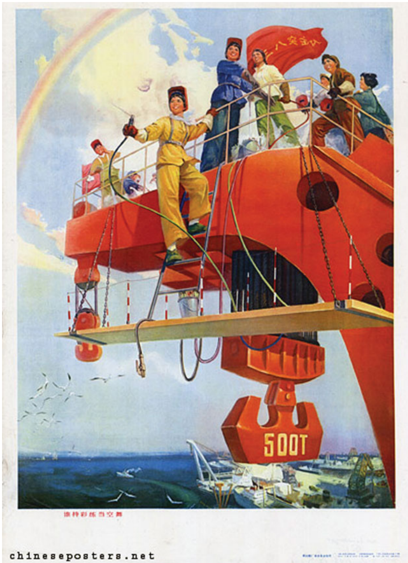
Figure 2. Those holding colored ribbons dance high in the sky, 1976.

once found attractive. The image of heroic, empowered women holding up half the sky has been displaced by other figures, embedded in other powerful systems of signification: the sexy young mistress, the savvy woman business executive, the canny rural entrepreneur, the oppressed migrant factory laborer or sex worker. Along with the expansion of opportunities for gendered self-fashioning in the reform era has come increasingly visible evidence of gender discrimination and gendered violence. As many scholars have observed, gender difference and gender hierarchy have been rediscovered as the natural order of things in official and popular realms.