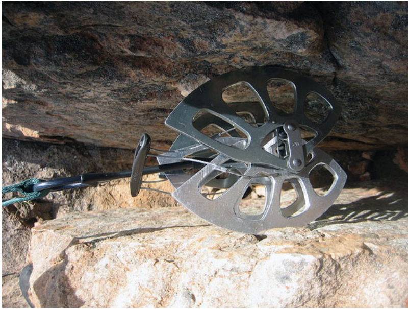
Figure 9. Spring-loaded camming device.

Such a tool doesn't predict the shape of the rock face or tell you what outcropping is coming up next. It is, however, a way to anchor yourself, hanging on for dear life, while you figure out, one specific step at a time, the best way to traverse the rock face to the next fissure, which may or may not be connected to the one that currently supports you (see figure 10).