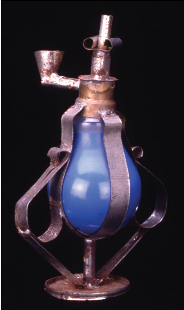
Figure 6. Oil lamp made from an electric light bulb and tin can, Kumase, Ghana.

anticipation of an electrification project that was now on indefinite hold (Godzich 2002). The lightbulbs sat around for awhile. Then the villagers—needing light—removed the metal base and filaments from the lightbulbs, let the inert gas out, filled the lightbulbs with kerosene or another fuel oil, fashioned a base out of Coke or beer cans discarded by the various experts and government officials who had visited the villages, and produced usable lamps.