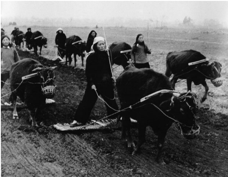
Figure 5. Shaanxi women learn farming skills, 1959.

The first story concerns a Shaanxi woman named Zhang Chaofeng. 7 Born in 1934, Chaofeng was a “child raised to be a daughter-in-law,” sent to the