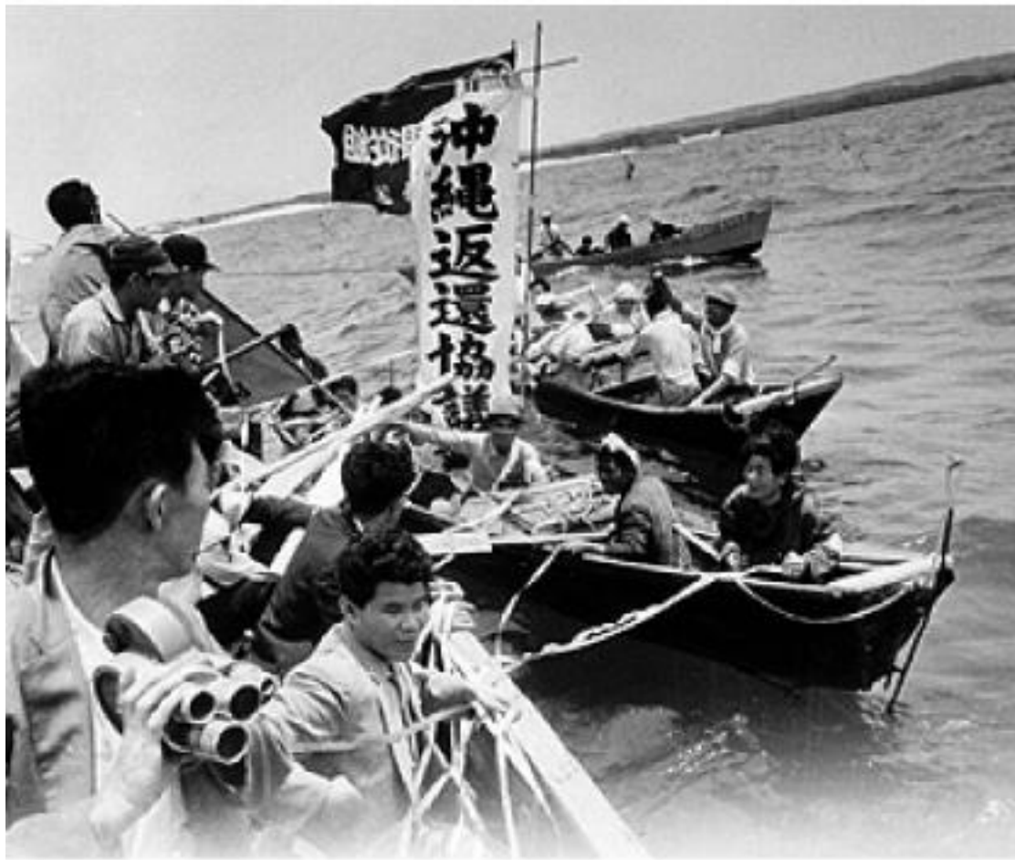
Figure 4. 4.28 Rally at Sea (4.28 kaijō shūkai ) at the 27th Parallel Border

Boats carrying Okinawan and Japanese activists convened at sea on the 27th parallel on April 28, the “day of humiliation,” when Japan regained its sovereignty, divided from Okinawa. Many of these activists also protested the continuing US military presence in Japan and Okinawa, both of which served as forward deployment bases for the American-led war that was then raging in Vietnam. These actions at sea can be seen as an extension of the earlier period of economic and political resistance. The demonstrations at sea symbolized their rejection of the border, the division from Japan, and continuing US military rule in the Ryukyus.