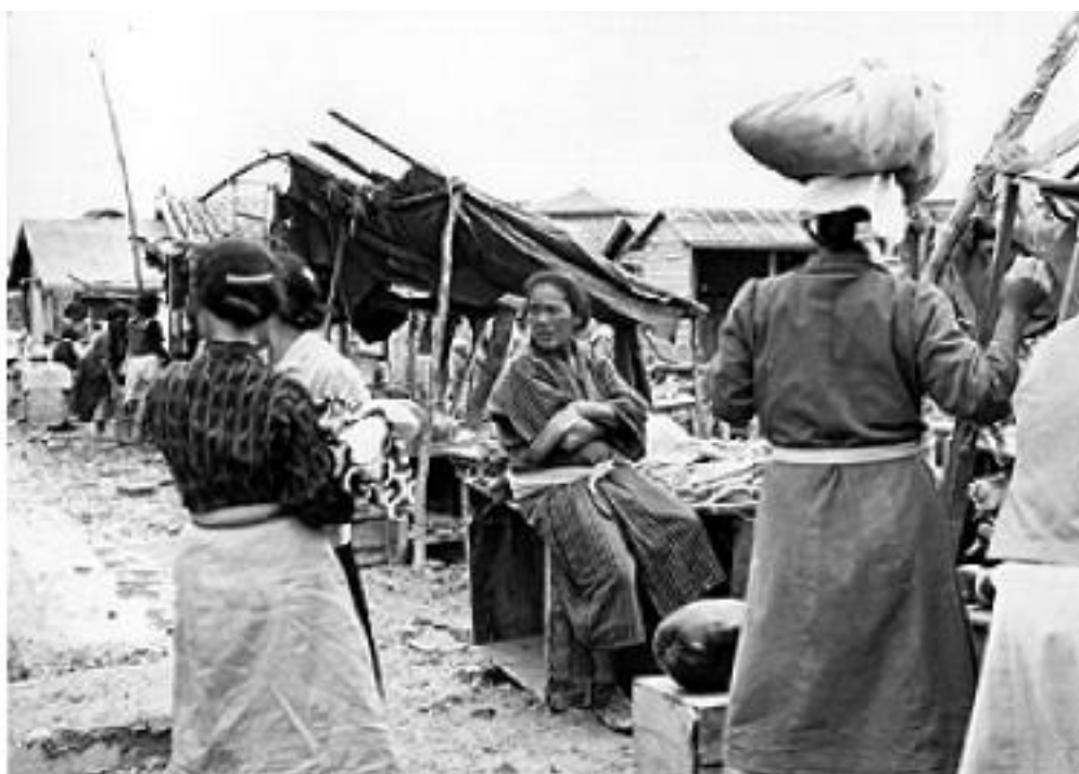
Figure 3. Black Market Scene in Naha, Okinawa, circa 1948

kinship networks. Okinawan employees at military bases often shared their hard-won senka with their friends and family, but they sold the bulk of their goods to black market brokers who traded them with other smuggled commodities for a profit. A popular Ryukyuan poem captures the distribution of labor in this underground trade, reflecting social conditions in Okinawa at the time: “best pickings at the top, black markets in the middle, we at the bottom must win senka .” In other words, the upper class clung to the US military for access to power and prestige, the middle class could secure a decent living by trading black market goods, so the lower class was left to fend for themselves in pursuit of senka . 32 In general, most of the senka was supplied by those who worked inside or lived nearby the major military bases in central Okinawa, then flowed into the thriving black markets in southern Okinawa. The emergence of new social classes in postwar Okinawa thus developed simultaneously with the geographical distribution of the US military bases and black markets.