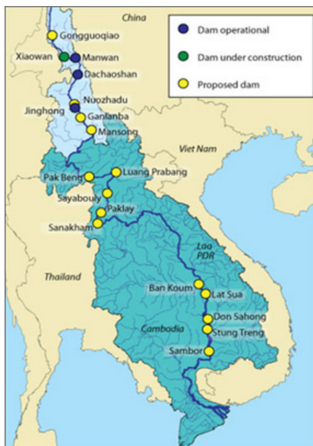
Map of dams on Lancang and Mekong Rivers from the Mekong River Commission

A report in May by the United Nations Environment Programme (UNEP) and the Asian Institute of Technology (AIT) warned that China's plan for a cascade of eight dams on the Mekong, which it calls the Lancang Jiang, might pose "a considerable threat" to the river and its natural riches. In June, Thailand's prime minister was handed a petition calling for a halt to dam building. It was signed by over 11,000 people, many of them subsistence farmers and fishermen who live along the river's mainstream and its many tributaries.