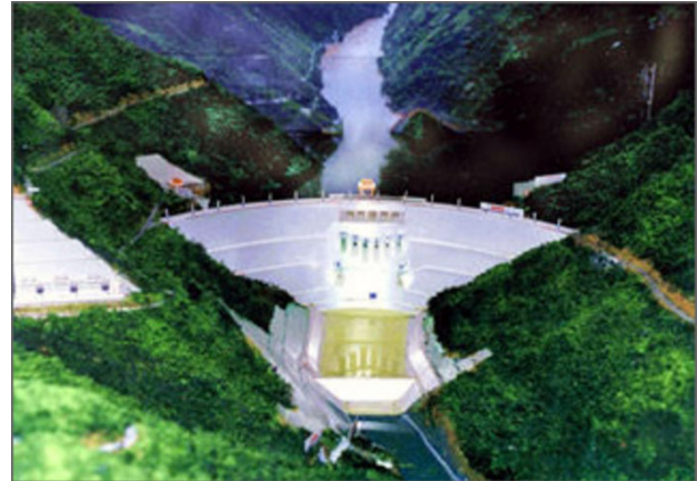
China's Xiaowan dam, the world's tallest, poses a huge challenge to the Mekong river basin countries

The Mekong, one of the world's major rivers, starting in Tibet and flowing through south China, Burma, Thailand, Laos, Cambodia, and Vietnam, provides sustenance through irrigation and fishing to those living in its basin. But it also provides hydroelectric power through dams, three of which were built in China, with more planned. And it is precisely these dams that are now threatening the water supply, the livelihood of those living downstream, and the relations between China and its southern neighbors. A fourth Chinese dam, Xiaowan, that should generate 4,200 megawatts of power, could affect the level of fish stocks in Cambodia and water supply for Vietnam's rice fields. But China contends controlling the water flow will prevent the adverse effects of erosion caused by the Mekong's flooding cycle and will supply renewable energy. Winning the debate or coming to a workable compromise is further complicated by China's refusal to join the Mekong River Commission, an inter-government agency whose members include the four of the downstream countries. And though the global financial crisis has put on hold other dams being planned by the downstream countries, China is moving ahead with its plans.