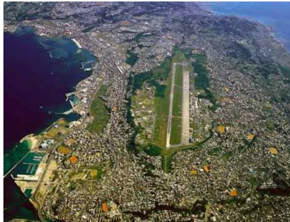
Futenma Marine Air Station in Ginowan

Initially, this Futenma Replacement Facility (FRF) was to be a modest (45 metres in length according to the first designs) 2 “heliport” to be located somewhere “off the east coast of Okinawa.” That soon turned out to mean offshore from the fishing port of Henoko, a site that had first featured in a 1966 US Navy “Masterplan,” at the height of the Vietnam War, for a comprehensive naval and marine facility. From 1996, the Henoko plan was repeatedly either rejected by an Okinawan citizenry angry at the injustice of one more base being built in their already excessively base-concentrated prefecture or accepted by local government authorities under such conditions (civil-military joint use, fixed term, etc) that amounted to rejection. But the more the project was rejected or subjected to stringent, impossible conditions, the more it returned, larger, more ambitious, and freer of conditions.