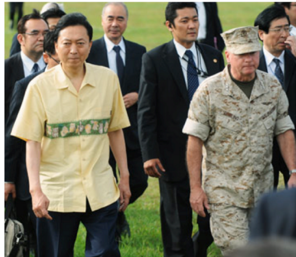
Hatoyama visits Okinawa, May 4, 2010

Mainland media for the most part simply relayed the US message, turning a blind eye to the intimidation and interference in Japan’s affairs. 42 Only the Okinawan newspapers lambasted the Hatoyama government for its inability to counter the US’s “intimidatory diplomacy” (as Ryukyu shimpo put it) and for its drift back towards “acceptance of the status quo of following the US.” “If that is to be the new government,” it concluded, “then the change of government has been a failure.” 43 In the US, officials, pundits, and commentators alike supported the Guam treaty formula and showed neither sympathy nor understanding for Japanese democracy or Okinawan civil society.