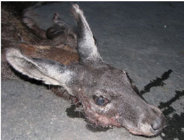
PLATE 2 Carcass of an adult female musk deer hunted in the Kashtoun mountain range (Fig. 1) on 3 July 2009.

model is composed of 84.1% closed forest, 11.4% open forest and 4.5% rock outcrop. All fragments of suitable habitats have the three types of land cover except the easternmost areas along the international border with Pakistan, which have no rock outcrop cover.