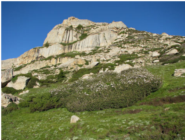
PLATE 1 Summer habitat of musk deer Moschus cupreus in Nuristan, with rock outcrops, alpine meadows, scattered currant bushes, dense rhododendron, and juniper scrubs on steep slopes ( \geq 20^\circ ), above the tree line ( > 3000 m).

north, and both sides of the border of Kunar province in the south-east. Interview responses suggest that 5 years before the survey musk deer had a wider distribution in the south of the region, at lower elevations. According to hunters in Waygal, musk deer perform seasonal altitudinal movements; in winter, in response to heavy snowfall, they descend from preferred pastures above the tree line to coniferous forests.