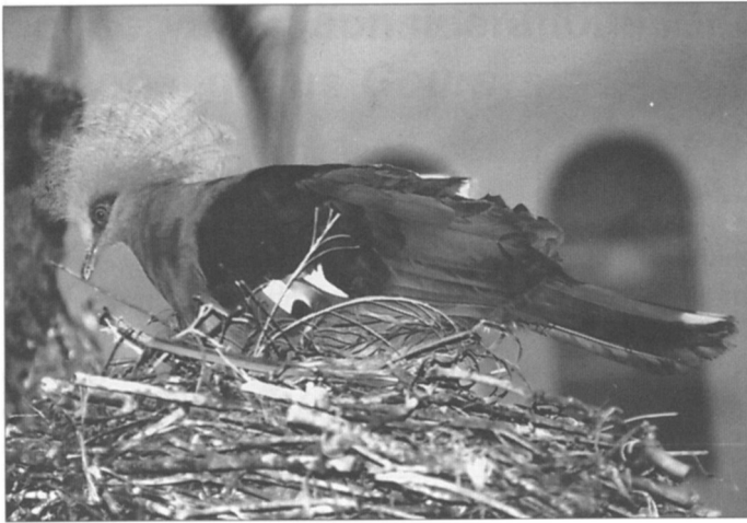
Goura cristata (Koen Brouwer).