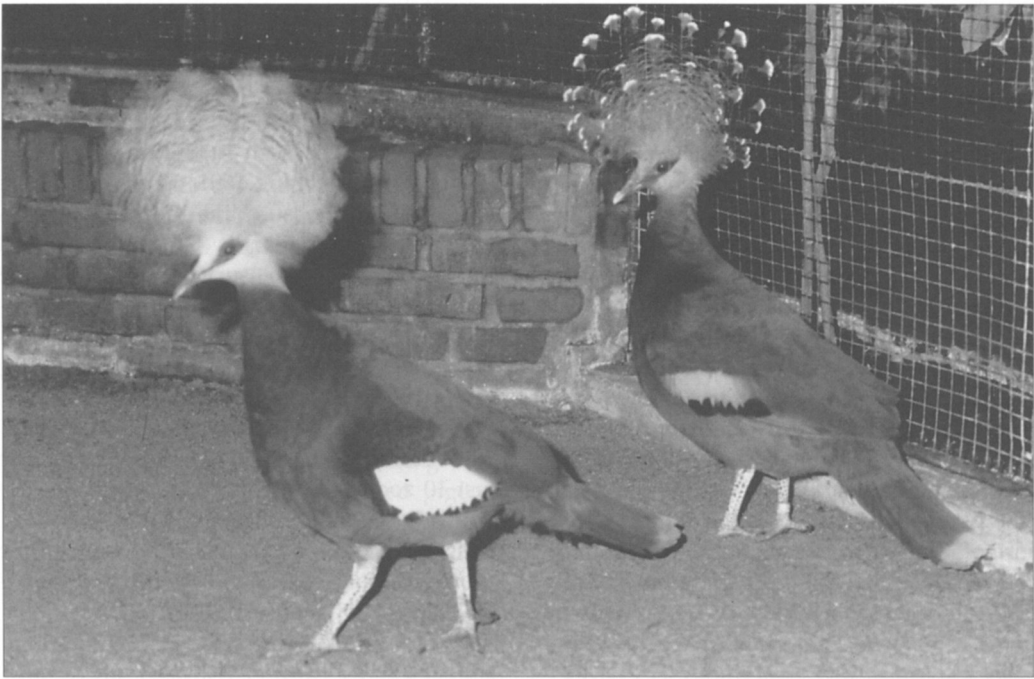
Goura scheepmakeri (left) and Goura victoria (Rotterdam Zoo).