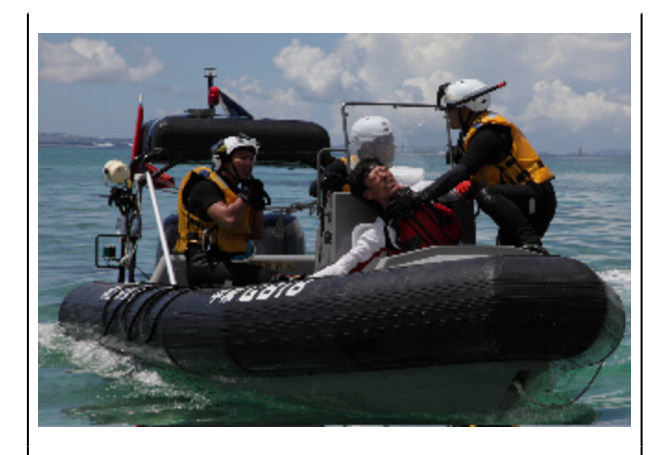
Henoko: Protesting Canoeist seized by Coastguard, (Photo: ©Tomoyuki Toyozato)

On July 1, 2014, the ODB started the construction phase of the Henoko plan on Camp Schwab amid fierce protest from local citizens and municipal governments. The Japanese government had adopted heavyhanded approaches to carry out the Henoko plan. With approval from the U.S. military, the Japanese government created new "temporary restricted water areas," expanding the previous off-limit zone of 50 meters off-shore from Camp Schwab to two kilometers,<sup>7</sup> mobilizing an armada of vessels under the command of the Japanese Coast Guard and beginning to drive away, or to "capture" and "release" protesters venturing towards the site in canoes and kayaks,<sup>8</sup> threatening them with prosecution under the infamous keitoku ho (a draconian, rarely used, "special" criminal law dating to 1952.<sup>9</sup> The Okinawan media reported (September 12) that "[a]cts of violence are taking place on a daily basis," and that assault proceedings had been initiated against three of the Coast Guard officers.<sup>10</sup>