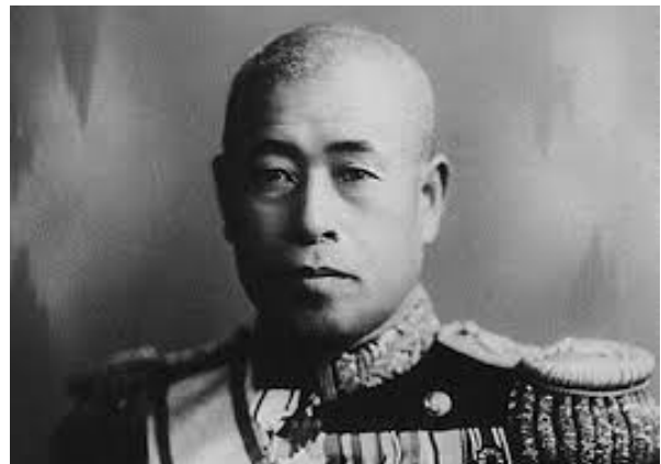
Admiral Yamamoto Isoroku.

These two battles had the long-term effect of ruining the navy. That is to say, the navy forgot to use this time to take stock of itself. This resulted in a failure to appreciate the importance of improving its weaponry and staying abreast of the times. I recall having read somewhere that Admiral Yamamoto Isoroku [1884-1943], commander of the Combined Fleet, once told the emperor: "The Japanese Navy will take the Pacific by storm." What an utterly stupid thing to say! With commanders like him no wonder we didn't stand a chance.