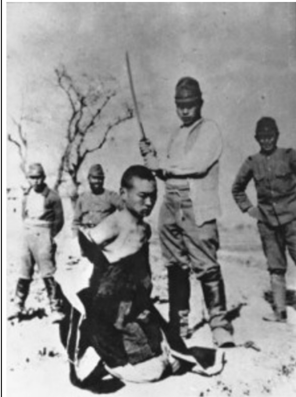
Chinese being beheaded at Nanking.