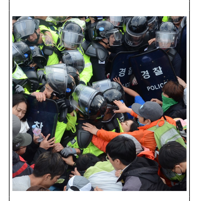
September 7, 2017, in Soseongri, South Korea.

Apocalyptic panic and glib memes frame much of American discourse about the current North Korean nuclear crisis. Yet the North Korean crisis poses a challenge to the mandate of South Korea's new liberal president, Moon Jaein, to usher in an era of truly democratic politics, and indeed, to the fate of his administration. On the critical issue of US plans to install a terminal high area altitude defense (THAAD) system, an issue that has roiled the waters among South Korea, the United States and China, Moon has chosen to leave intact former conservative president Park Geun-hye administration's undemocratic legacy.