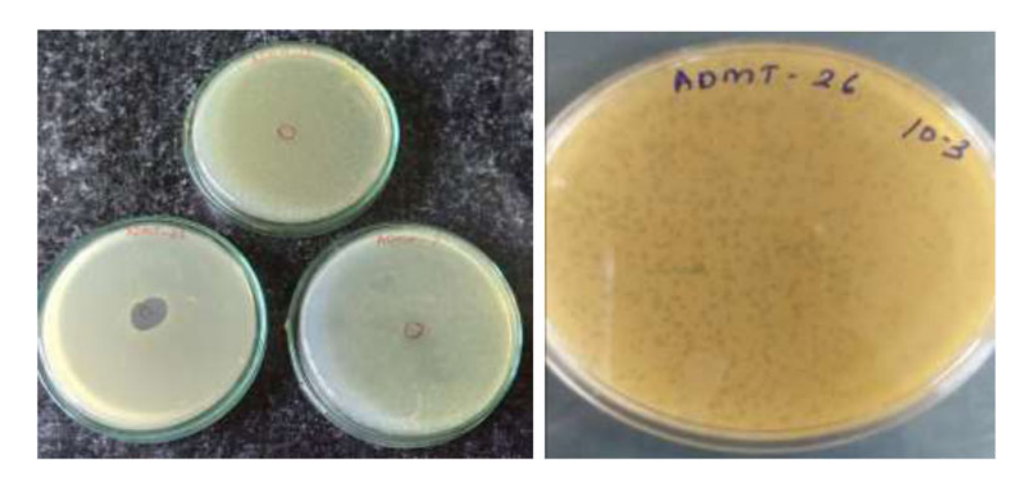
Figure 2. Plaques of Lphi2ADMT26 phage on Lc. paracasei ADMT26 lawn. (a) A clear zone of lysis was observed for ADMT 26 on spot assay. No zones were observed for ADMH 13 and ADMH 7 (b) Clear plaques were observed after double-layer agar plating of enriched phages.