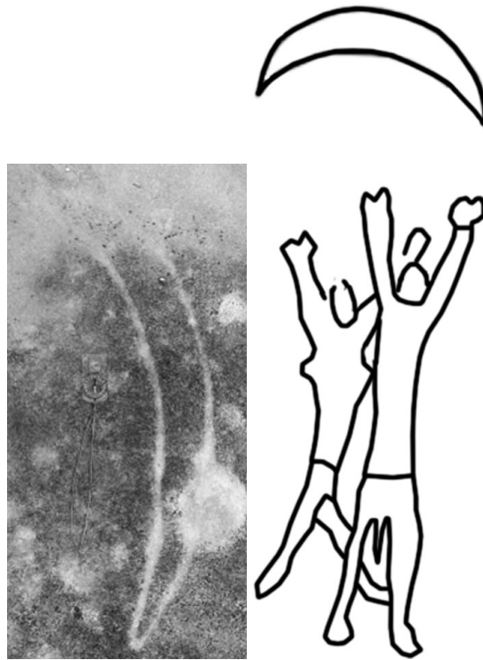
Figure 1. ( Left ) A rock engraving showing a crescent. ( Right ) A rock engraving of a man and woman reaching up to a crescent. Could this represent an eclipse?

up towards a boomerang in the sky. But if these shapes are moons, then why is the moon shown with the two horns pointing down, since that configuration is seen only in the afternoon or morning when the Sun is already high in the sky, and the moon barely visible?