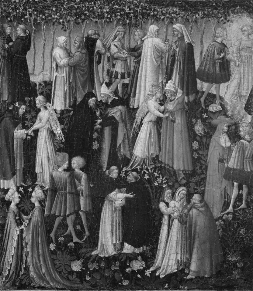
Figure 1.2 Giovanni di Paolo di Grazia (Italian, Siena, 1398–1482) / Paradise / 1445/ Image ID: KCD1RT / Photo: Artokoloro/ Alamy Stock Photo.

in so doing, coming to be alienated from the creation of which we are a part. It is also a story of returning to God, and to the Edenic state of one's proper place in that creation.