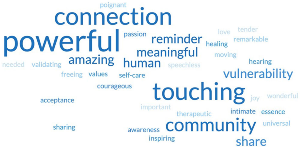
Figure 3. Themes and feedback word cloud.

health professionals' states, "The cognitive ability to give meaning and shape to stress appears to determine resilience development or maintenance." (Zanatta et al. 2020) In addition, through active listening we create psychological safety for vulnerability and narrative knowing, or the ability to create shared understanding (Buckley et al. 2018; Sandelowski 1994) which can provide affirmation and healing.