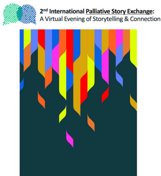
Figure 1. Sample invitation.

month prior to a PSE, we send an invitation by email (Suppl Fig 1) informing potential participants of the event and inviting them to consider sharing a story. Importantly, other than events specifically facilitated for a singular clinical discipline, all our events are intentionally interprofessional. We seek to empower a diverse group of storytellers from varied professional backgrounds, lived experience, places of work, etc. To leave space for participants to share the stories most important to them, we encourage potential storytellers to reflect on what has moved them in recent months, be it at work or at home. Rather than provide a directive, we ask the open-ended question “What can you not stop thinking about?” We do instruct storytellers to move away from traditional medical case reports, and instead focus on their emotional reactions to moments in their professional and personal lives.