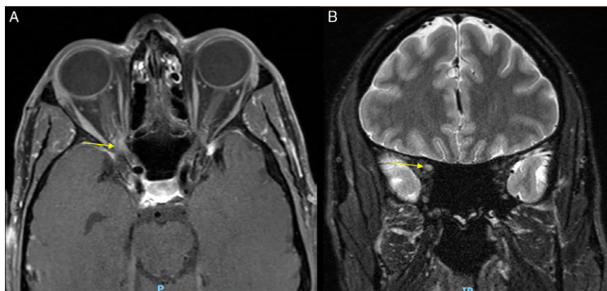
Figure 2: Axial T1-post gadolinium magnetic resonance imaging (MRI) of the orbits demonstrating right optic nerve enhancement (A; arrow). Coronal T2 MRI images demonstrating increased T2 signal in the intracanalicular optic nerve (B; arrow).

relationship to HZO such as non-arteritic anterior ischemic optic neuropathy, which can be precipitated by an intraocular pressure spike seen with the hypertensive uveitis caused by VZV. Our case suggests that AC paracentesis can be helpful for confirming VZV etiology in retrobulbar HZON when there is no visible associated intraocular inflammation. Our patient had a positive VZV PCR as a result of incomplete treatment of the anterior uveitis and this flared later in the course of his disease. The case also suggests that the AC was a higher yield location compared to CSF even with the retrobulbar location, which is contiguous with the CSF space in the orbit. We therefore suggest that AC paracentesis be considered in equivocal cases of HZON.