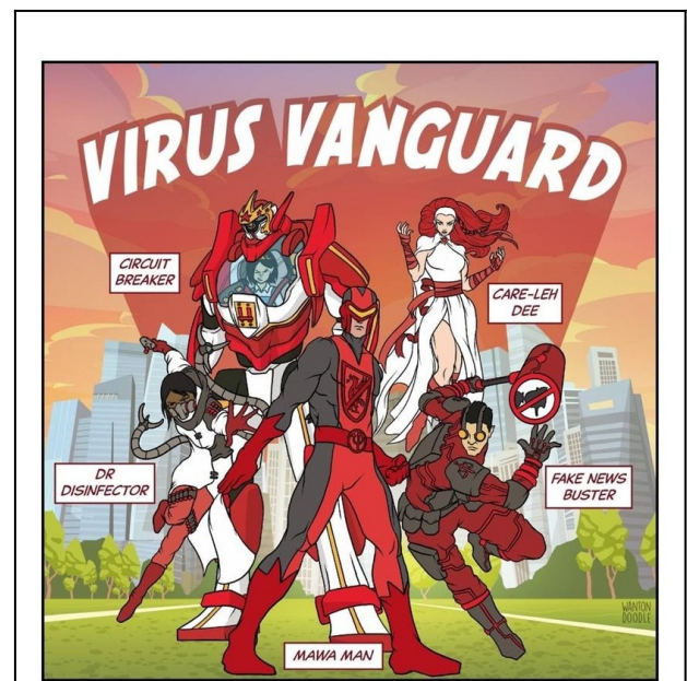
Superheroes removed after public

COVID-19 crisis as a political transition opportunity as much as a public health crisis. While other heads of state have prominently fronted their country’s public engagement, Lee slid into the background, forcing several ministers from the relatively inexperienced 4G cohort to take control” (Vadaketh, 2020). In those halcyon days, government officials and media outlets were still telling people not to wear masks unless they were sick, and threatening construction companies who sent their foreign employees to hospitals for COVID-19 tests due to a lack of supplies and an explicit choice to prioritize the rest of the population.