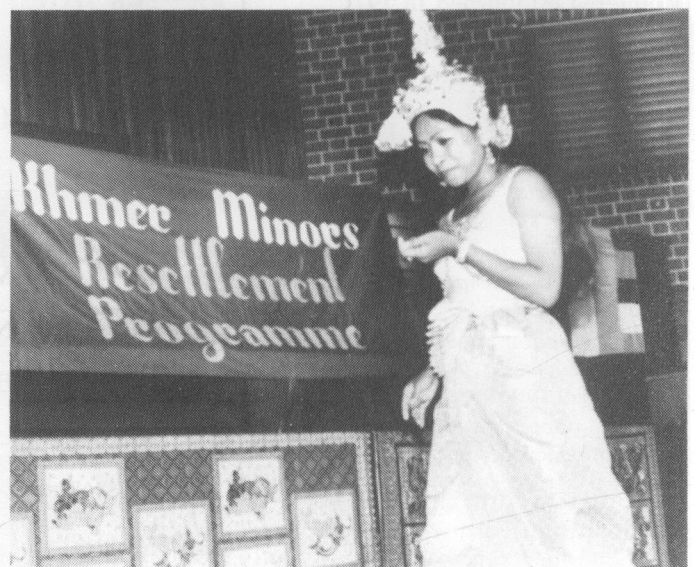
A young Cambodian dancer performing a traditional dance as part of the proceedings at the launch of Burnside's A New Life.