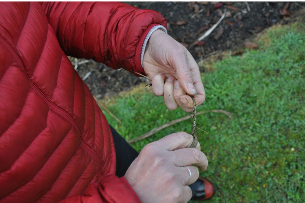
Figure 5. Lizzie weaving with Ti kōuka (Cabbage Tree) leaves

Lizzie — “Well, I guess again, it’s activity based , isn’t it? Yeah. So, anything like weaving is always amazing. We’ve got a girl who comes in Friday. She just loves it. And she just picks it up so fast. I mean, I’m not a great weaver, but I can make a few things (Figure 5).