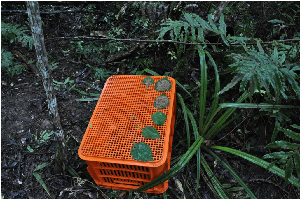
Figure 4. Image of the games the children were playing in the private space.

And there are sometimes when you really want to take a photograph, but you just don’t, because you just you just know that it’s not the right time. Place. ” (Figure 4)