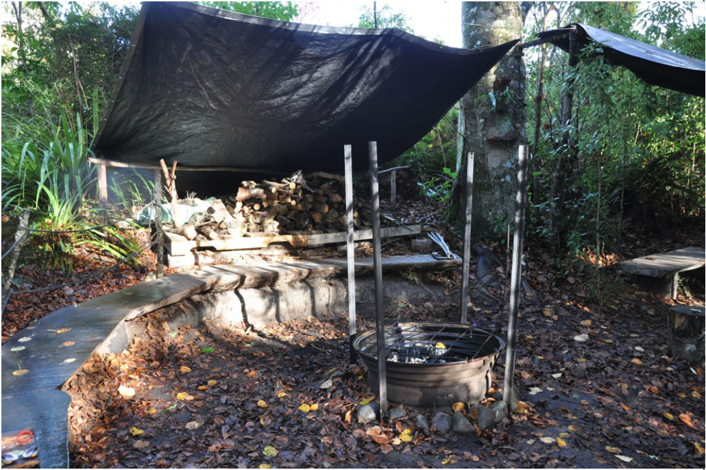
Figure 3. Image of the fire-pit area.