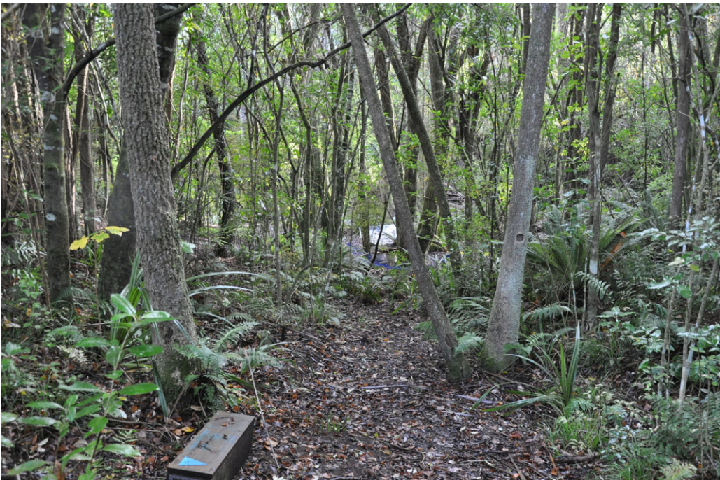
Figure 2. Part of the site they use regularly with a predator trap (placed by a local charity to catch invasive mammals).