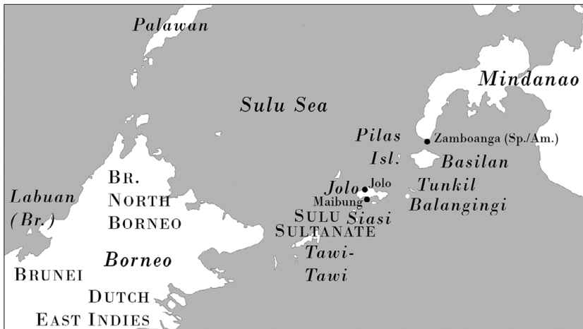
Map 2: The Sulu Sea

kingdoms to expel Muslims from the Iberian Peninsula from the eleventh to the fifteenth centuries. The Spanish consequently labelled their Muslim adversaries in the Philippines ‘Moros’, a condescending term for Muslims derived from the Mediterranean and Iberian context. From the point of view of the Spanish, and to some extent also from the point of view of the Moros, the protracted conflict was interpreted as part of a long-standing global struggle between Christianity and Islam. 1 In the course of this struggle, and as a result of increased contacts with the wider world from the sixteenth to the nineteenth centuries, the Muslim identity of the Moros was strengthened, largely in opposition to the Spanish incursions and their attempts to propagate the Christian faith. 2