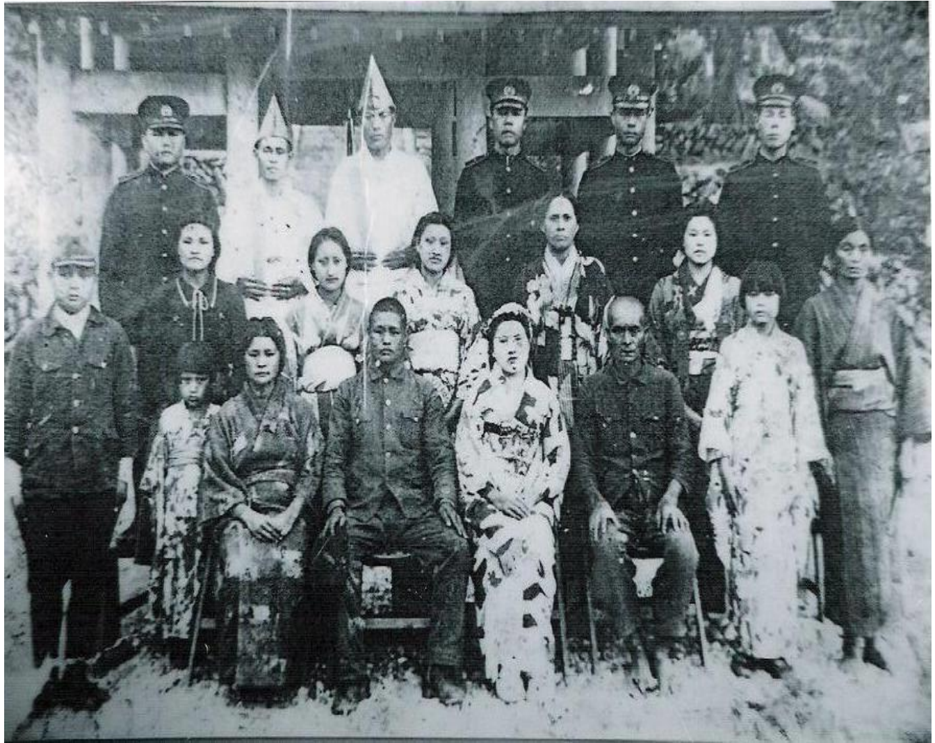
Japanese and Ayatal in Taroko