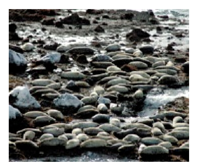
Spotted seals take a break in Yagishirito off Hokkaido

In a boon for tourism, record numbers of spotted seals have appeared along the Sea of Japan coast of Hokkaido. Visitors are flocking to the areas to shoot pictures of the popular sea mammals affectionately known as goma-chan.