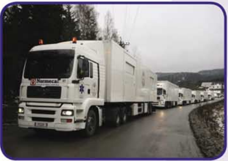
All kinds of clinics or hospitals in MultiSpace