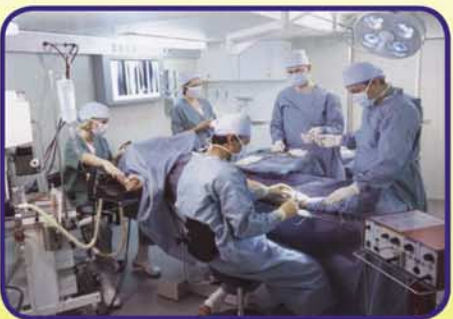
NorBase single and expandable containers