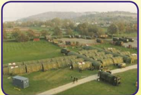
Rofi inflatable tents