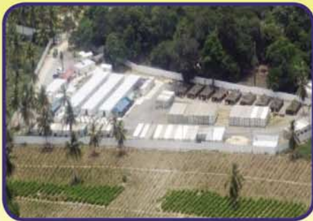
Thai Tsunami Victim Identification Centre