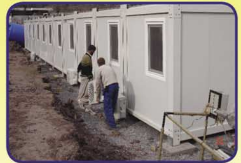
MSF Hospital, Hattian Bala, Pakistan