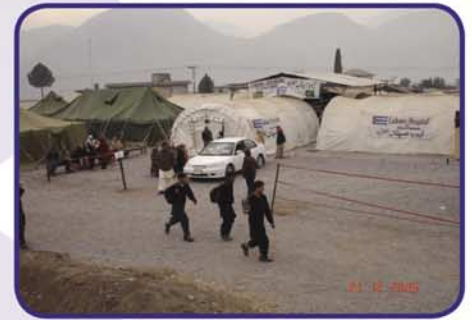
Cuban Hospital, Muzaffarabad, Pakistan