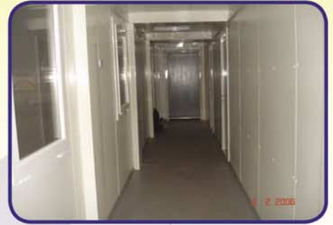
Inside MSF Hospital in Hattian Bala

Number One in the world for partial and turn key solutions incl. Transportation, Erection, Management, Training, Maintenance, Education, Administration, Storage, Out sourcing, Medivac, etc.