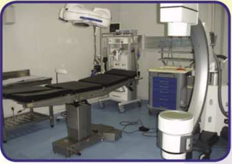
Inside OT in KATIKO Referral Hospital