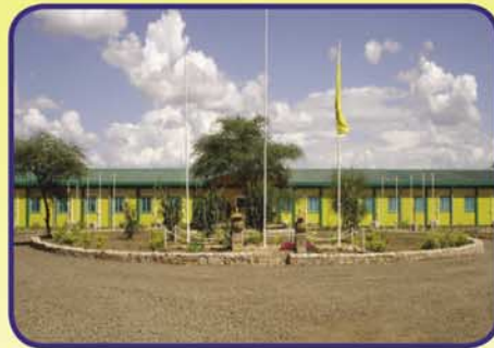
KATIKO Referral Hospital, Southern Sudan