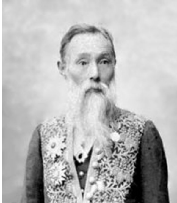
Sensai Nagayo, the father of public health in Japan.

scientists, and policymakers charged with scouring the world for technologies, practices and ideas that might be brought back to Japan and used to construct a modernist settlement.