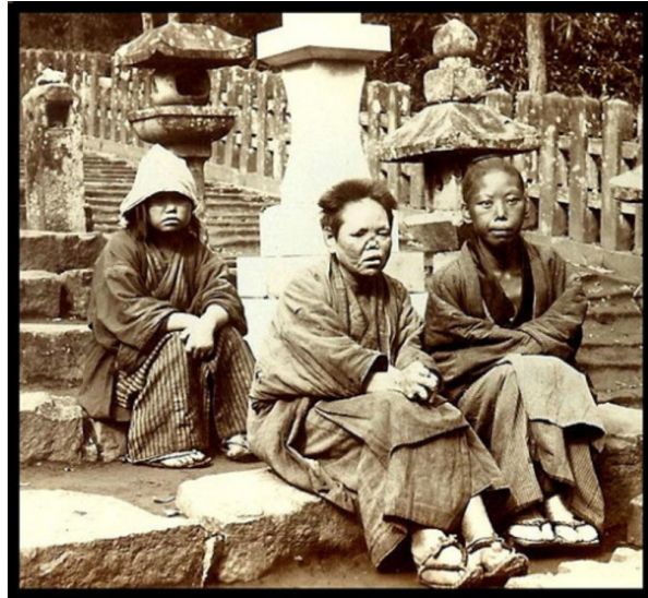
The horrible visibility of leprosy in Japan: Date and source unknown. Found here .

Leprosy now appeared unregulated and “lepers” appeared in great conglomerated numbers in cities. People with leprosy walked the streets willy-nilly. They gathered at temples and shrines to beg for alms, displaying “the horrific morbidity of leprosy for the first time: the severely disfigured faces and nodulated bodies, the ceaseless groaning of a man with painful neuralgia, and the labored breathing” 12 of those whose throat and bronchi were filled with leprous nodes.