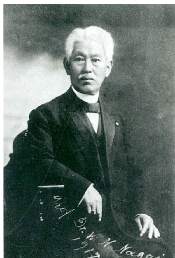
Nagai Nagayoshi: Father of modern chemistry in Japan and discoverer of methamphetamine

Formation of a modern research and development scientific community policed by principles of shared assumptions, universal methods, replicable results and empirically observable outcomes was a vital part of Japan's modernization: without it there could have been no modernist settlement. The modern science of chemistry and its technological relative, pharmaceutical research and development, were core parts of the settlement.