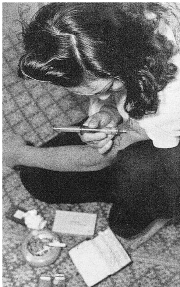
Injecting Philopon (hiropon).

After surrender the political problem solved by methamphetamine changed. Now the stimulant was used to resolve the anxieties, trauma, and exhaustion produced by the political problem of defeat, loss of sovereignty and living in the ruins of war under American occupation. By the late 1940s more than 20 Japanese drug companies produced and marketed methamphetamine for relief of hypotension, fatigue and sluggishness. 28 After manufacture and sale of methamphetamine in powder or tablet form were banned in 1949, manufacturers turned to injectable solutions. Miriam Kingsberg reports that use of the stimulant was very high and she gives as evidence the perhaps not very exemplary story of twenty-year-old Sakemaki Shūkichi who was charged with the murder of a young girl while under the influence of methamphetamine in 1954: "At the time of the murder, Sakemaki had been injecting himself with twenty to thirty ampoules of hiropon (Philopon), a type of methamphetamine, daily for two years" she writes. 29 And although Sakemaki's use may have been on the high end of the national methamphetamine usage scale, intense use of methamphetamine delivered intravenously was happening all over Japan.