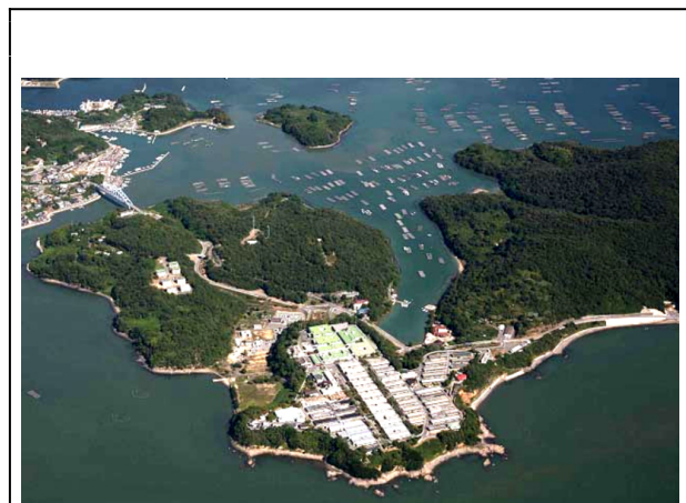
National Sanatorium Oku-Komyo-En

years. At autopsy, they harvested samples of liver tissue. These they preserved using formalin, then archived. The collected tissue samples then remained available for research at the sanatorium pathology archive. Beginning in 2006, they were reviewed, re-sampled and embedded in paraffin for optimal preservation. Around 2008, a team of researchers made two remarkable discoveries about the history of patient deaths at Oku-Kōmyō-En. First, the team found a steep increase in patient deaths caused by cirrhosis of the liver after 1960, and second, it observed an equally sharp increase in patient deaths caused by liver cancer after 1970.