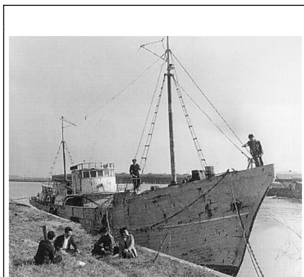
The Daigo Fukuryū Maru shortly before leaving for Bikini Atoll

meant that the HCV introduced as a corollary of programs to eradicate schistosomiasis leaked all over Japan between 1940 and 1980, forming a huge bolus of infections that would not be seen until the last years of the 20 th century. Yet, once the different parts of this bolus came to light, they could all be tracked back to elements of the modernist settlement and modernization in Japan. Take for example, the story of the Daigo Fukuryū Maru . On March 1, 1954 the United States detonated a hydrogen bomb at Bikini, an atoll of 23 islands circled around a 230 square mile lagoon in the western Pacific region of Micronesia. The explosion turned out to be considerably larger and more powerful than anticipated.