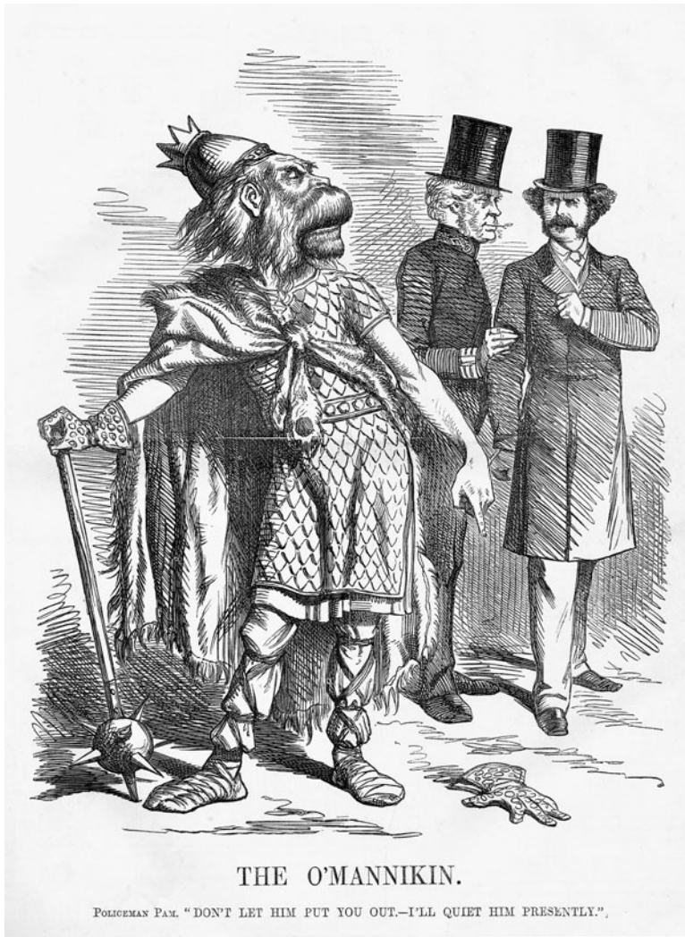
Figure 1—"The O'Mannikin," Punch , 8 March 1862, 94.

the nineteenth century than Palmerston's supporters intended. Indeed, the expanding imperial project required that idealized English masculinity co-opt some of the allegedly outdated martial masculinities that had previously been employed to exaggerate a consensus against interpersonal violence in England.