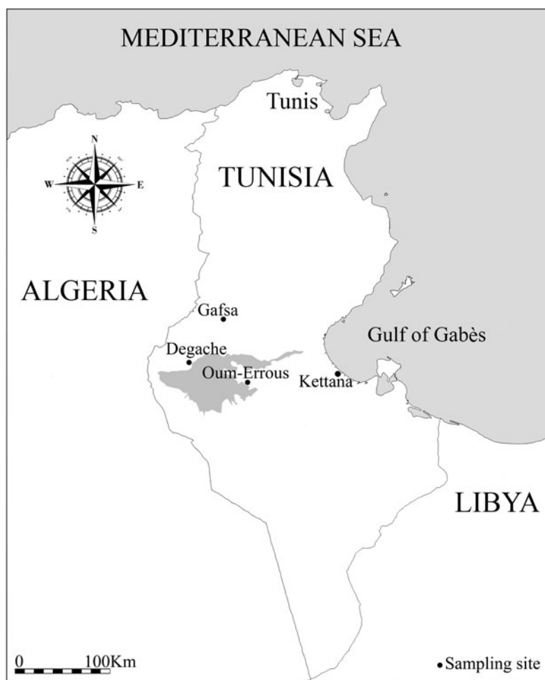
Fig. 1. Map of southern Tunisia showing the location of sampled oases.

with other flaviviruses, this ELISA tool can be conveniently used as a surrogate test to detect antibodies to many flaviviruses, particularly those belonging to the Japanese encephalitis serocomplex [33]. ELISA-positive samples were further investigated through virus-specific microneutralization tests (MNTs) against flaviviruses reported in the area where the sera were collected [33–35].