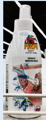
Figure 4 Mosquito Repellent Designed to Protect against the Gay Virus Engineered by NATO

Although a better understanding of how marginalized communities are targeted by extremist actors is beneficial, developing a framework to more effectively protect vulnerable populations is essential, as there are consequences for security studies and public health more broadly. For example, research has shown that targeting queer rights has resulted in higher levels of discrimination and decreased mental health across several populations (Haas and Lannutti 2024). The stripping of LGBTQ+ rights within the political space combined with the violent victimization of members of the community catalyzes the traumatic effect on queer populations. Declining mental health directly affects the health care enterprise and poses risks for self-harm if not treated. This risk should be of particular concern given trends that show the LGBTQ+ community is at greater risk for self-harm and suicidal ideation in general, not accounting specifically for recent hostility