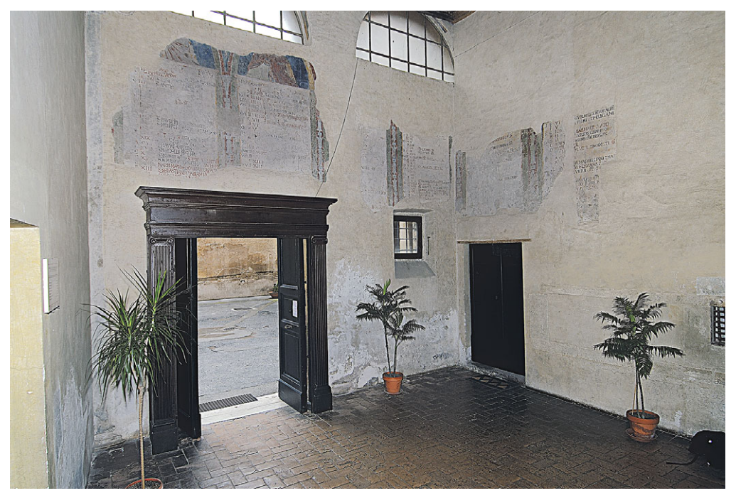
1.3. Calendar Room, ca. 1244–54, Santi Quattro Coronati, Rome.