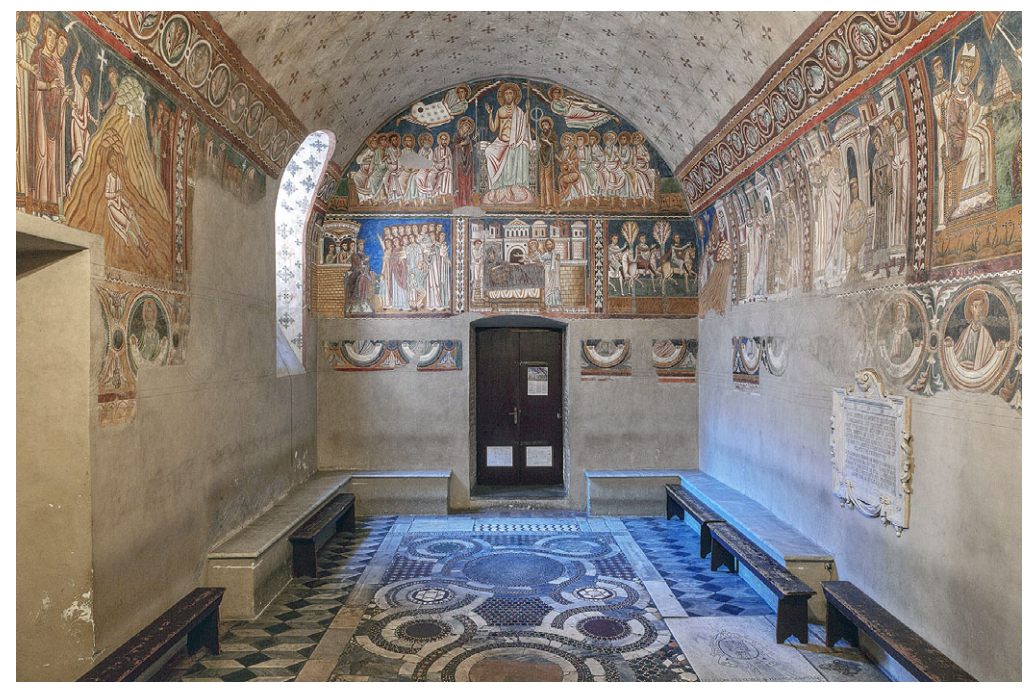
1.2. Frescoed interior of Sylvester Chapel, ca. 1244–54, Santi Quattro Coronati, Rome.