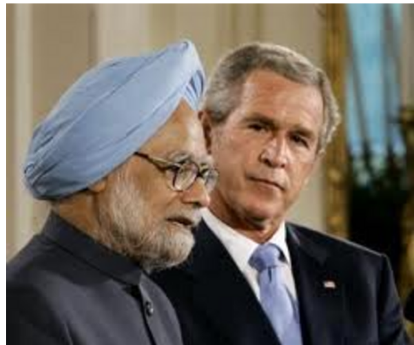
Pres. Bush and Prime Minister Singh

Japan shed its nuclear inhibitions in September 2008 (following a great deal of persuasion by then US President George W. Bush) and voted in favor of an India-specific waiver at the Nuclear Suppliers' Group. In a sense, Japan lost its non-proliferation virginity at the NSG nearly two years ago. Moreover, India's track record in non-proliferation has been impeccable - in contrast to that of Pakistan.