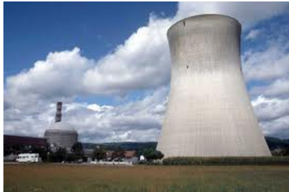
Indian nuclear power plant

between the two Asian powers and lay the foundation for more robust strategic ties in the long term, with an eye on China. However, New Delhi will not be much affected if the nuclear deal with Japan falls through because it has signed similar deals with eight other countries - France, US, Russia, Kazakhstan, Mongolia, Namibia, Argentina and Canada. The only problem India would face if the India-Japan nuclear deal falls through is that the US-India nuclear deal will not be fully implemented as two of the American giant companies involved in nuclear energy -- General Electric and Westinghouse -- are wholly or partly controlled by Japanese companies.