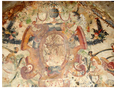
Fig.1. Details of the 16 th century frescoes. The biological colonisations covering the frescoes are clearly visible.