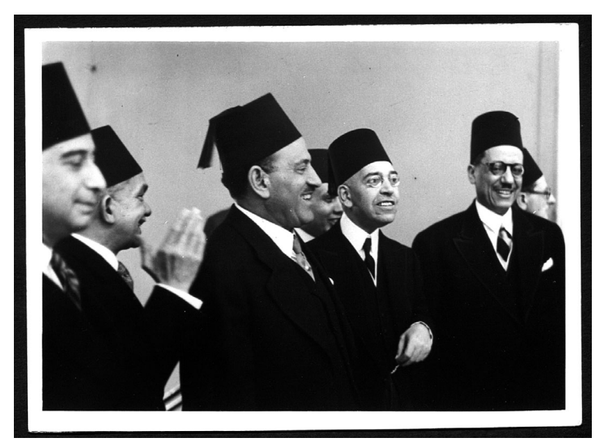
FIGURE 5.4 Mostapha El – Nahas centre with the Egyptian delegation in Geneva.