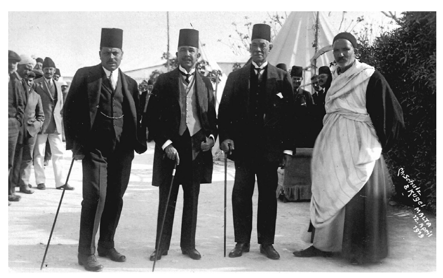
FIGURE 5.1 The Wafd Delegation detained in Malta. Left to right: Mohamed Mahmoud, Ismail Sidqi, Saad Zaghlul, Hamad el Basel.

travel restriction on Zaghlul and the Wafd would ease tensions, as would foreign recognition. Allenby agreed, backtracking on Wingate's deportations, allowing Zaghlul to proceed to Paris.<sup>44</sup> The Wafd leaders were released and proceeded to Paris via Marseille. However, Allenby had only recommended their release once he believed that the danger posed by the Wafd had been neutralised. Wilson had given his assurances of recognising the Protectorate, and the Egyptian delegation only discovered this on their way to Paris. Now, even if they arrived in Paris, the doors of the Conference would be closed to them.<sup>45</sup>