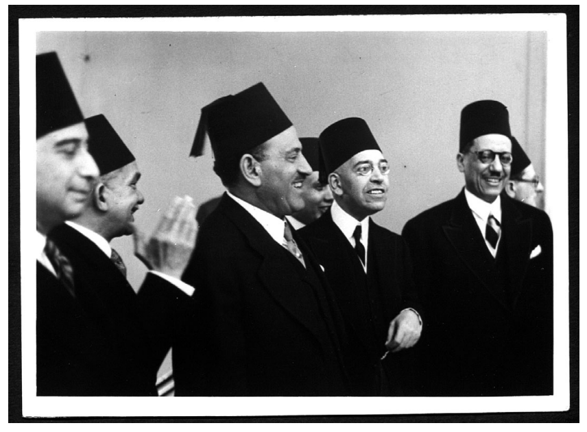
FIGURE 5.4 Mostapha El – Nahas centre with the Egyptian delegation in Geneva.