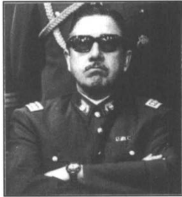
From Soldiers in a Narrow Land