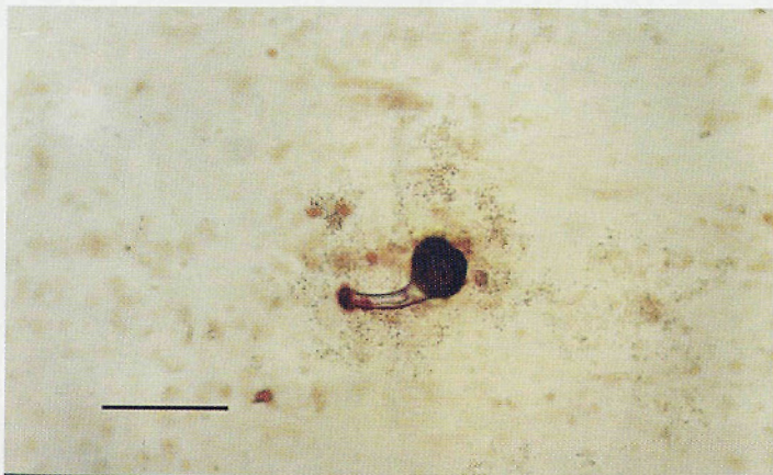
Figure 2: Central hair is a non-"bear claw" cystolith from marijuana. Magnification at the microscope is 200 diameters. (Scale bar = 100 microns)