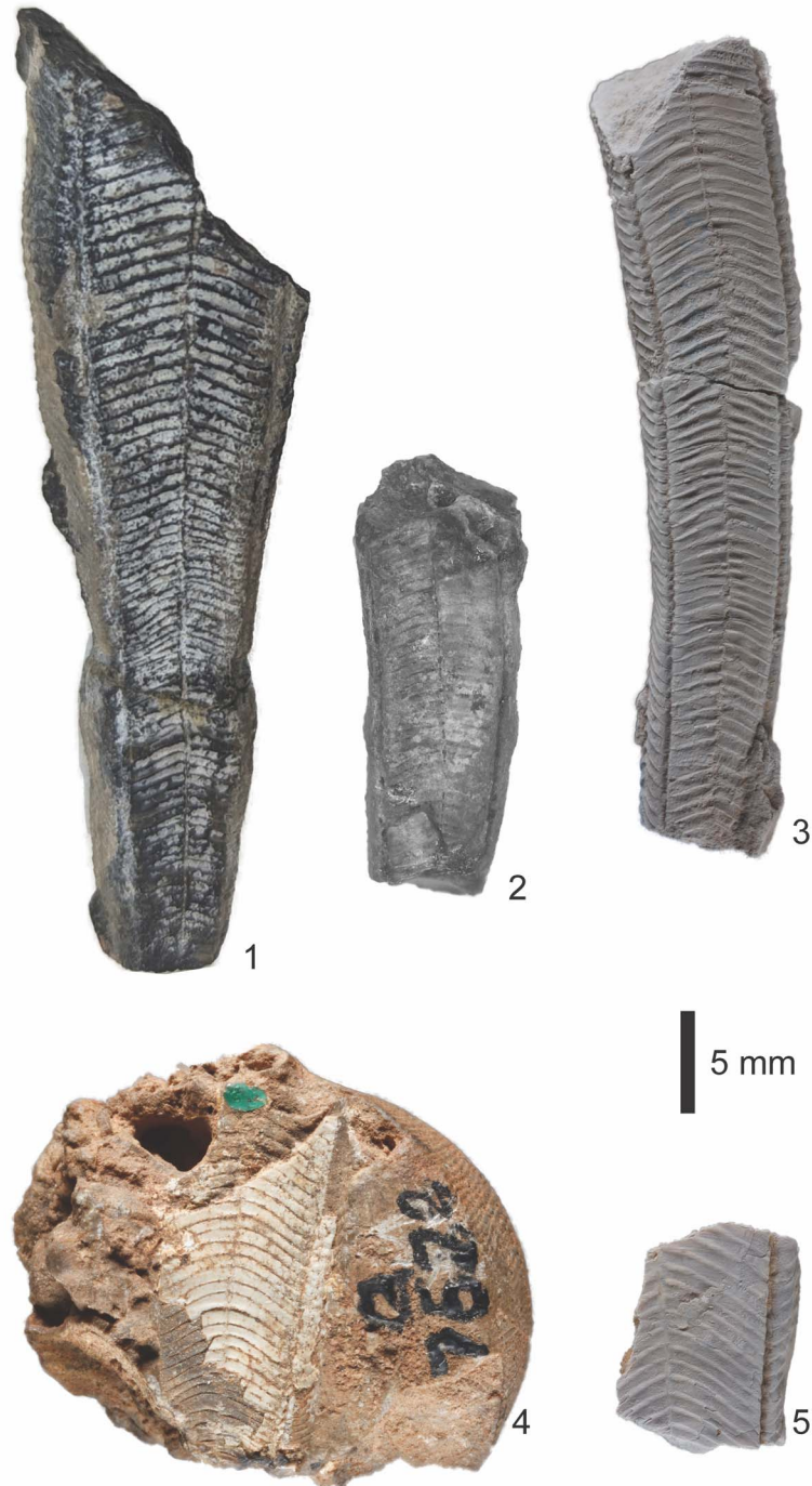
Figure 1. Light photographs of the previously designated holotype, hypotype, and plesiotype specimens of Paraconularia planicostata (Dawson, 1868) from the lower Windsor Group (Upper Mississippian, mid–late Visean) of central Nova Scotia and Cape Breton Island, Atlantic Canada. All specimens oriented with the apertural (oral) end at the top. (1) Holotype RM(MU) 2749; (2) hypotype NSM023GF017.141; (3) hypotype GSC 21767; (4) plesiotype GSC 7672a; (5) plesiotype GSC 7672. Scale bar = 5 mm.

Cove in southwestern Cape Breton County, Cape Breton Island, Nova Scotia (Dawson, 1868, 1878, 1891; Bamber and Copeland, 1970; Moore and Ryan, 1976; Fig. 2). The two plesiotypes (GSC 7672 and 7672a) were discovered near the town of Windsor, central Nova Scotia (M. Coyne, written communication, 2023), and thus they may have been collected from the Avon River and/or Miller’s Quarry localities of Bell (1929). The