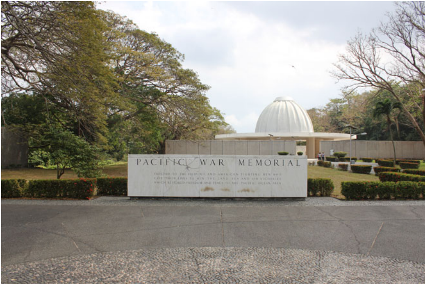
Figure 1. Pacific War Memorial, Corregidor, Philippines.

location and its character as “much broader than a ‘Battle Monument’ ... It is a symbol to be erected by the people of the United States and given to the people of the Philippines.” 3 Rather than simply commemorating American achievements in battle, it memorializes a relationship and an imperial legacy that the United States was unwilling to relinquish in the early decades of the Cold War.