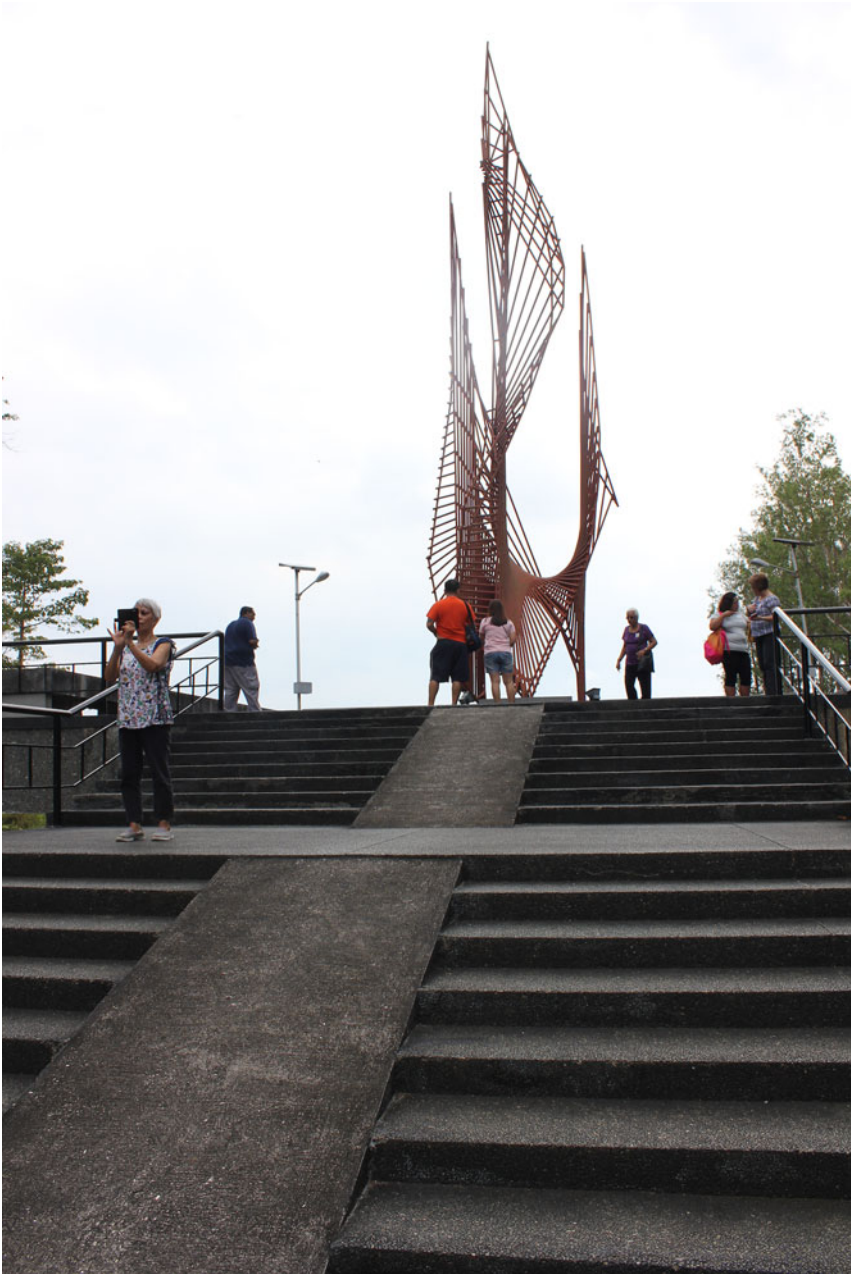
Figure 5. Eternal Flame of Freedom, Corregidor, Philippines.

as eating and drinking, that are as a consequence prohibited. Together with the altar, the circumscription of behaviour makes it reminiscent of a place of worship. Upon the altar is an inscription: