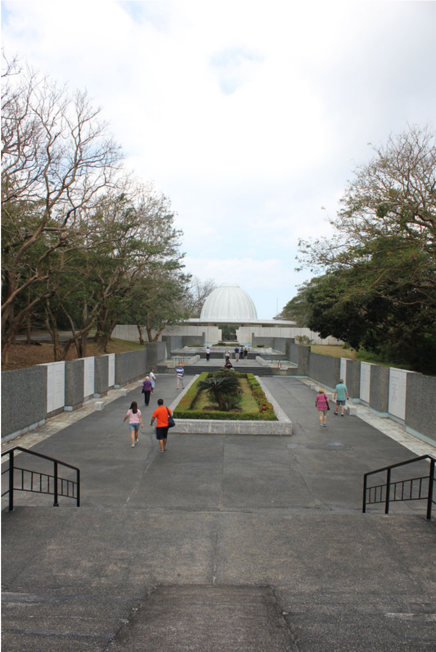
Figure 4. Pacific War Memorial, Corregidor, Philippines.