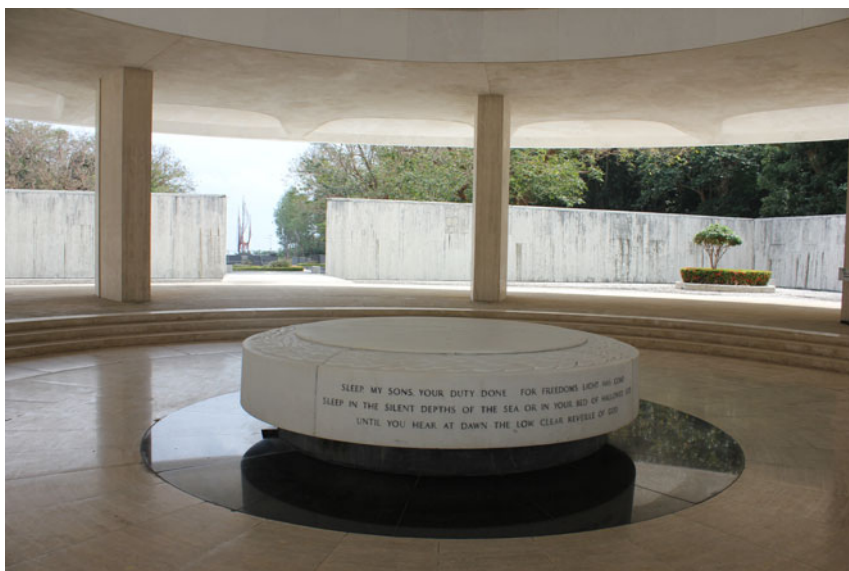
Figure 6. Pacific War Memorial, Corregidor, Philippines.

Sleep, My Sons. Your Duty Done ... For Freedom's Light Has Come Sleep In The Silent Depths Of The Sea, Or In Your Bed Of Hallowed Sod Until You Hear At Dawn The Low, Clear Reveille Of God.