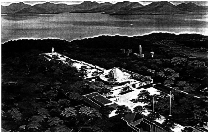
Figure 3. Redesign by Naramore, Bain, Brady, and Johanson, 1965.

structure the visitor is confronted with a marble tablet that identifies the title of the memorial and contains the following inscription: