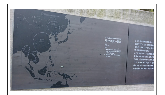
Information slate at Chidorigafuchi National Cemetery.

During the war, Japan, which had forcefully annexed the Ryukyu Kingdom in 1879, blatantly sacrificed Okinawa in an abortive attempt to protect the mainland. Astonishingly, the national cemetery that mourns the Japanese war-dead openly declares that those who perished in the Battle of Okinawa had died in "kaigai", that is overseas, beyond Japan's shores.