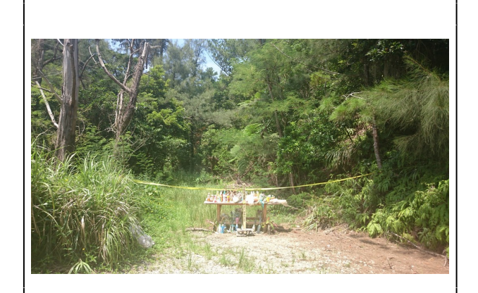
Site where the body of the rape and

On April 28, 1952, when the San Francisco Peace Treaty took effect, it left Okinawa under U.S. military rule just as Hirohito had proposed. Sixty-five years later, while the U.S. military base concentration continued in Okinawa, a former Marine, then an employee of U.S. Air Force Kadena Base, sexually assaulted and killed a 20-year old Okinawan woman and abandoned her body in Onna Village. Coincidentally, the act occurred on April 28, the day Okinawans commemorate as "the Day of Humiliation," as the Peace Treaty detached Okinawa while the rest of Japan enjoyed post-Occupation independence.