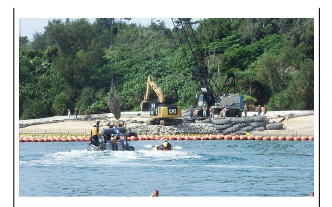
A protester on a kayak approaches Henoko construction site, May 15, 2017.

On April 25, Okinawa's governor Onaga Takeshi held a press conference in response to the start of the construction of retaining walls by the Japanese government in Oura Bay, off the coast of Henoko, on the Northeastern shore of Okinawa Island. Many recognized this as the official launch of construction of the new Marine base. Onaga's angry remark that the state was "throwing 'sute-ishi' (riprap) into the ocean without sufficient explanation to Okinawa" invoked a painful association with the Battle of Okinawa, the last land battle in the Pacific theatre of WWII. Between late March and early July 1945, the Japan-U.S. battle took 120,000 lives of the more than 460,000 residents of the island prefecture. Okinawan people subsequently used the term "sute-ishi," or sacrificial stone, to describe the nature of the battle, meaning that Japan sought to prolong the war at the sacrifice of Okinawans to buy time for the Imperial Headquarters to prepare for the U.S. land invasion of the Japanese mainland. Now, seventy-two years later, "sute-ishi" is used again to describe the assault against the sea, whose bounty provided food for the local residents to survive the deadly battle.