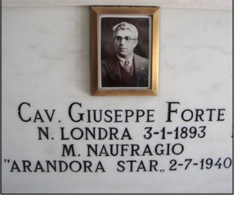
Figure 7. Documents in stone: Italy; photos Ceresa and Forte families