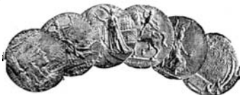
Gold Medal, Allahabad, 1910.

Paris, 1900. Brussels, 1910. Buenos Aires, 1910.