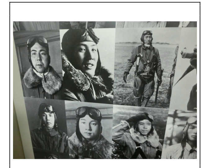
Death awaits: Pictures of kamikaze pilots form part of an exhibition currently being held aboard the USS Missouri in Honolulu.

You've just witnessed something very historic, because the exhibit that just opened is the first of its kind ever held outside of Japan with