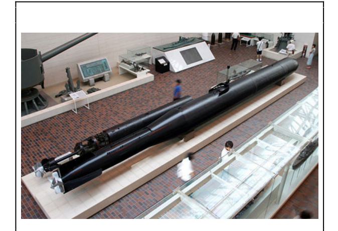
Kaiten 4 manned torpedo. Yushukan Museum, Yasukuni Shrine

4) You mentioned earlier about other Tokkō missions, including the suicide motorboats. But we hear mostly about the pilots, hardly ever about the other types of Tokkō. Tell us a little more about these other branches, and why you think the pilots have garnered all the attention, especially in popular culture and at Yasukuni Shrine, where they are more famously enshrined as heroes?