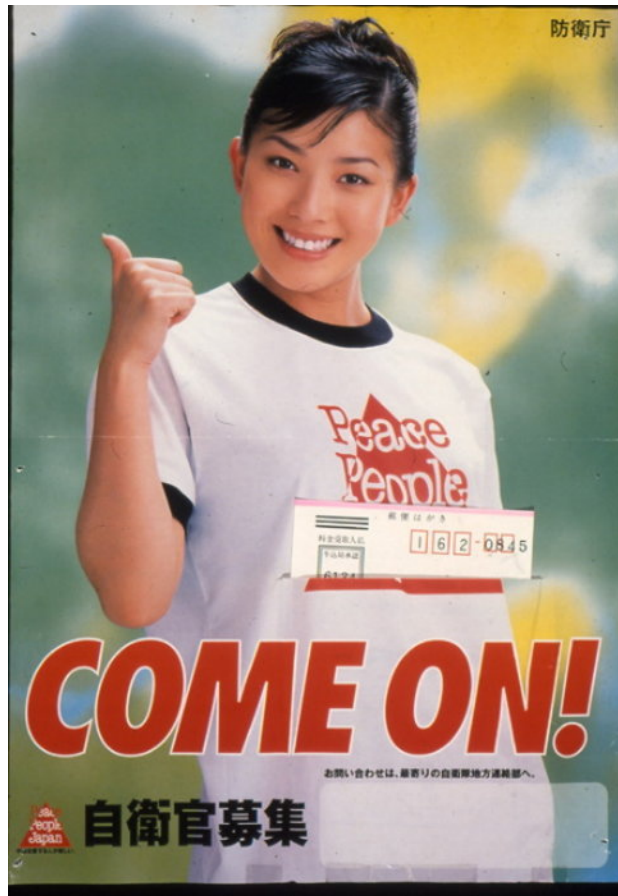
Figure 2: Today, public relations and recruitment posters of the Self-Defense Forces typically feature young, cheerfully smiling women and decisively non-militaristic slogans such as “Peace People Japan - Come On.”

Female figures render benign the notion of “pride” that otherwise could be associated with nationalism and imperialism. They are promoted as the peaceful gender: their smiling faces seem to suggest that there are nice, pretty women even in the Self-Defense Forces, and that they would not be here if the military were a violent, strange, dangerous organization. Representations of women in recruitment posters work in this fashion because of the naturalized pairing of “woman” and “peace” that mirrors a style of wartime propaganda which had established a strict gender division of men as combatants at the