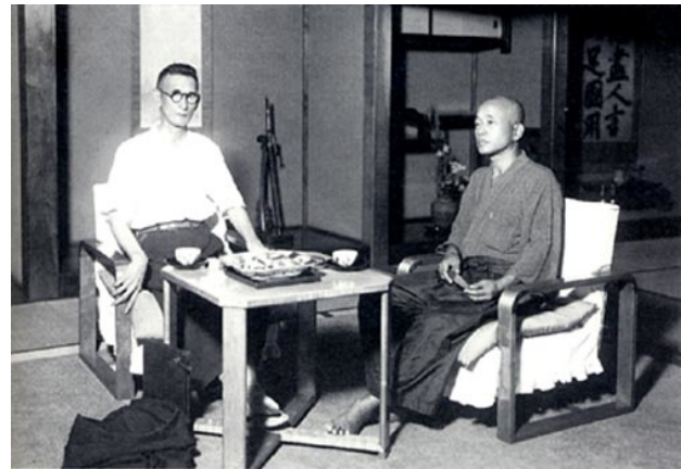
Okawa Shumei (left) and Ishiwara Kanji were known for radical nationalist and Pan-Asianist ideas. Okawa was also a pioneer of Islamic Studies scholarship in Japan

by a Japanese revisionist movie on Tojo Hideki and the Tokyo War Crimes Tribunal called Pride . In the end, I decided to write a thesis on Okawa Shumei's Pan-Asianism, which allowed me to discuss two controversial issues, namely the roots of anti-Westernism and the complex relationship between Pan-Asianism and imperialism.