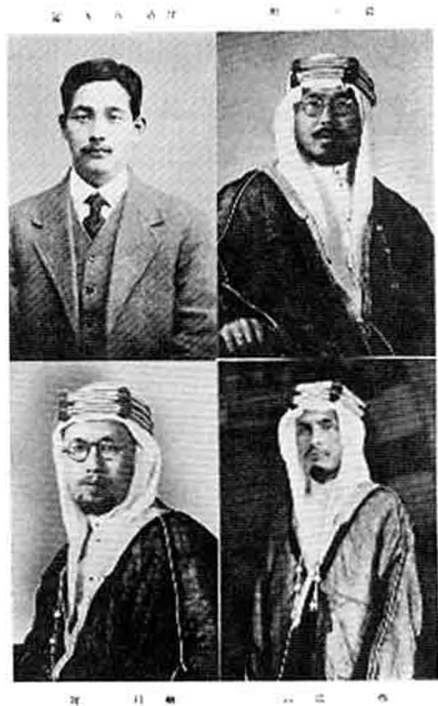
Japanese Muslim agents who joined 1934 and 1936 pilgrimages