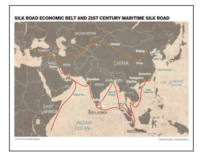
The "Belt and Road" and China's New Normal

These instances of the Chinese presence in Nigeria are part of a vast wave of Chinese investment and economic engagement in Africa, a wave which will intensify under China's development plans for what it has described as the 21<sup>st</sup> Century Maritime Silk Road.