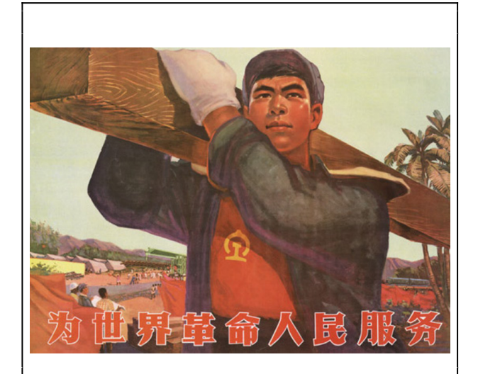
Serve the revolutionary people of the world, 1971.

China has become Africa's largest trade partner, and Africa is now China's second largest overseas construction project contract market and the fourth largest investment destination ... Up to now, China has completed 1,046 projects in Africa, building 2,233 kilometers of railways and 3,530 kilometers of roads, among others, promoting intra-African trade and helping it integrate into the global economy.<sup>17</sup>