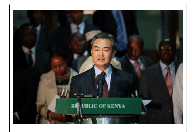
Wang Yi in Nairobi, January 2015.

The "Belt and Road" initiatives come at a key period for China. After enjoying double digit GDP growth in the first decade of the 2000s, China's growth has decelerated to what its leadership has described as a new normal of single digit growth.8 At the annual meeting of the National People's Congress in March 2015, Premier Li Kegiang announced that the government has lowered the annual growth target to 7%.9 This contrasts with previous decades when China enjoyed an average growth rate of approximately 10% between 1978 and 2013, with 11.5% between 2003 and 2007. In 2012 and 2013 growth decelerated to 7.7%, ushering in the new normal of mediumto-high growth and development, and triggering the need for the Chinese government to find new engines of growth. 10 The "Belt and Road" framework can be placed in this context as one of China's new engines of growth, offering fresh sources of employment and business opportunities to enable China to achieve what President Xi has highlighted in his political theory of the "Four Comprehensives" as the national goal of a moderately prosperous society. 11 In particular, the employment opportunities created by the "Belt and Road" initiatives will be needed for the 15 million students who are expected to graduate from universities, technical and