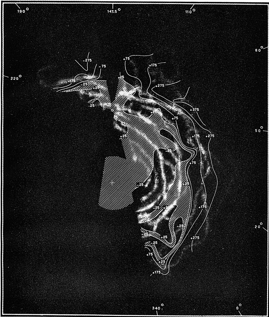
Fig. 2. Deviations of the hydrogen layer from the average galactic plane. This average plane is inclined 1^{\circ}.5 to the standard galactic plane. In the hatched part the deviations of the centre of the hydrogen layer from the average plane are less than 25 pc. The curves are contours of equal distance from the average plane; the numbers indicate the distances in parsecs.