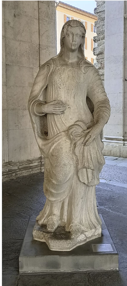
Figure 2. Unknown artist, Lodovica della Loggia . Botticino stone, Brescia, Piazza della Loggia, second half of the sixteenth century.

paint satirical verses. 55 After the marble lion was removed from the main public space, this mutilated and ‘talking’ sculpture disappeared, and the social life of this political object ended there.