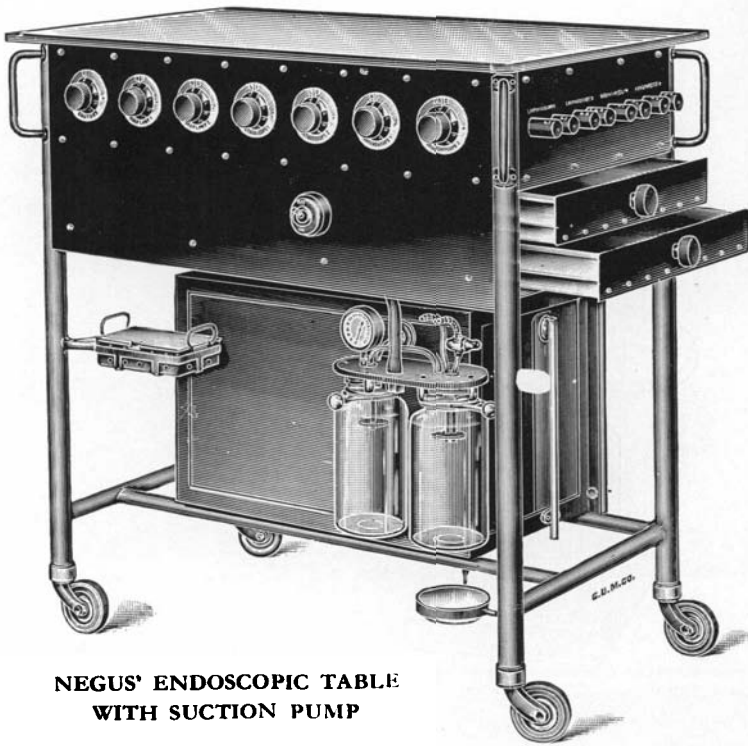
NEGUS' ENDOSCOPIC TABLE WITH SUCTION PUMP