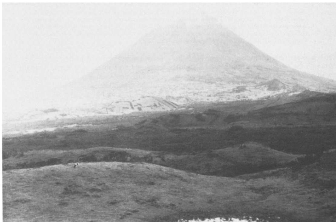
A view of the uplands of Pico, showing fragmented forest on the large mountain in the background, O'Pico, and on the volcanic cones in the foreground. Between these is the dark area of the completely forested Bosque da Junqueira (J.P. Haggar).

clearance since the Portuguese colonists arrived in the mid-fifteenth century has largely removed this vegetation (Godman, 1870). The antiquity and isolation of the flora is reflected in 8 of the 11 native trees being endemic to the Azores, and