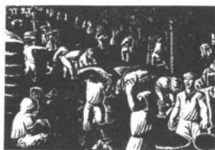
LABOR IN LATIN AMERICA